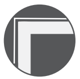
ceiling to wall