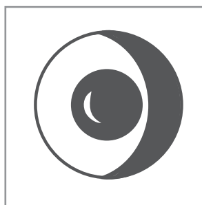
sensors / daylight harvesting