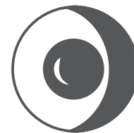
sensors / daylight harvesting