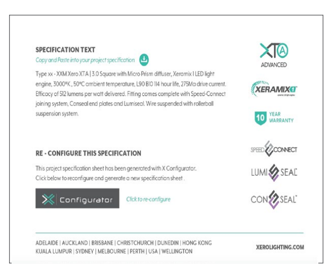
to access the X-configurator please visit https://xconfigurator.xerolighting.com/