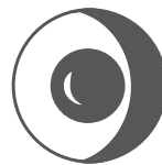
sensors / daylight harvesting