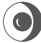
sensors / daylight harvesting