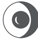
sensors / daylight harvesting