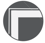
ceiling to wall