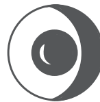
sensors / daylight harvesting