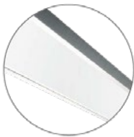
low UGR plexiglass

All XTA profiles come with many diffuser options for glare control in any application