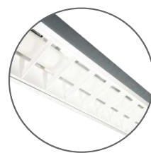
optic white louvre