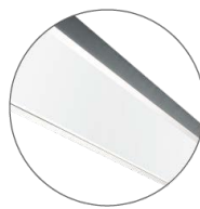
low UGR plexiglass

All XTA profiles come with many diffuser options for glare control in any application