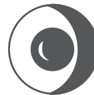
sensors / daylight harvesting